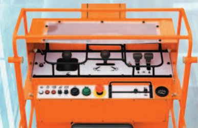
Operating panel designed for safety (Upper control panel)

Notes : Photos include optional equipment. Some of the photos in this brochure show an unmanned machine with attachments in an operating position. These were taken for demonstration purposes only and the actions shown are not recommended under normal operating conditions.